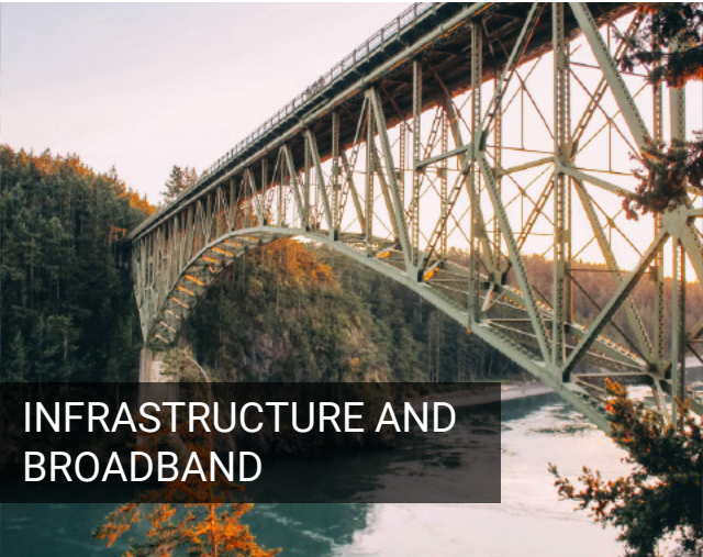
INFRASTRUCTURE AND BROADBAND