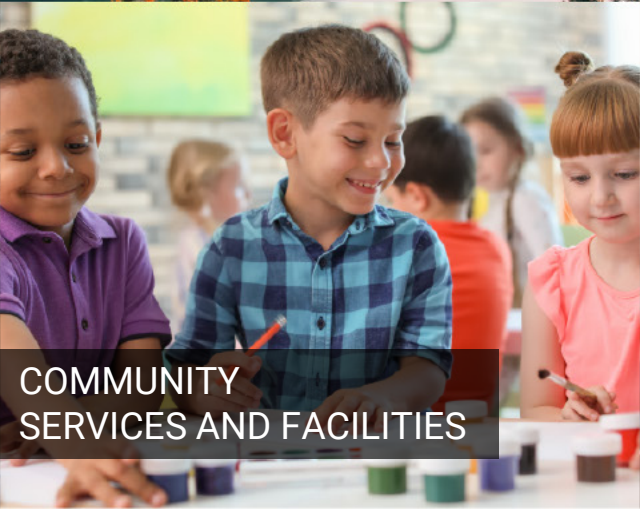
COMMUNITY SERVICES AND FACILITIES