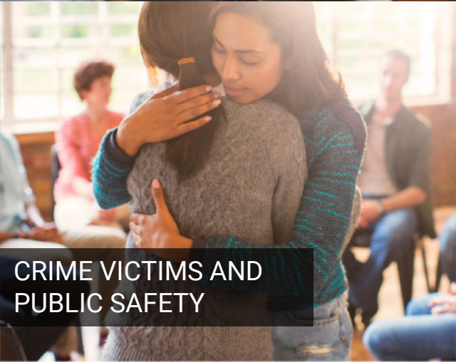
CRIME VICTIMS AND PUBLIC SAFETY