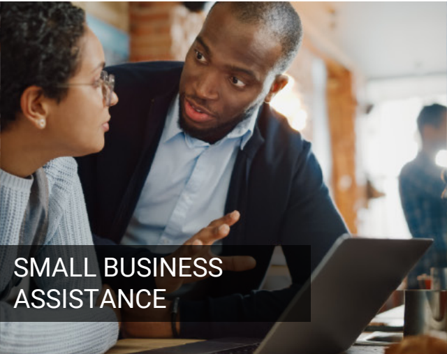
SMALL BUSINESS ASSISTANCE