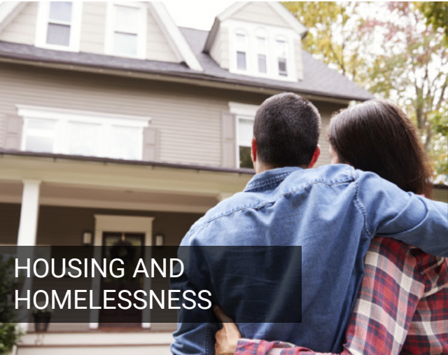
HOUSING AND HOMELESSNESS